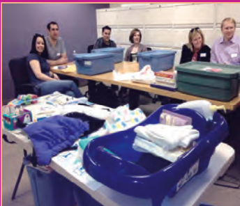
Conference room activities!