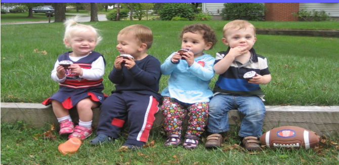
Anyone up for a football game???