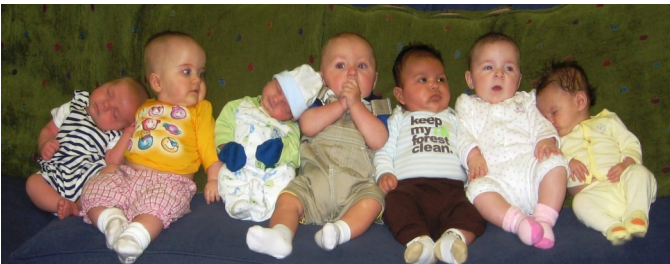
Some of our newest babies above